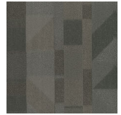
Achieve 86760 LRV 5.8