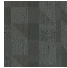
Transform 86585 LRV 6.4